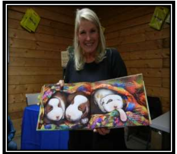
Author of Mochi , the dog who was bullied, and Mochi , the dog, greeted holiday market visitors