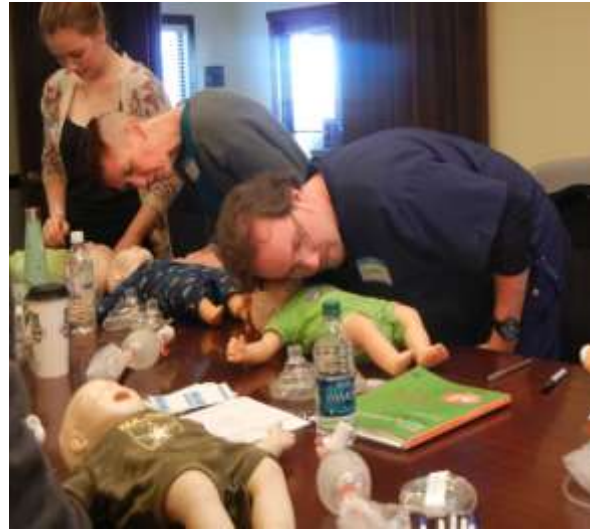
CNA students in CPR class