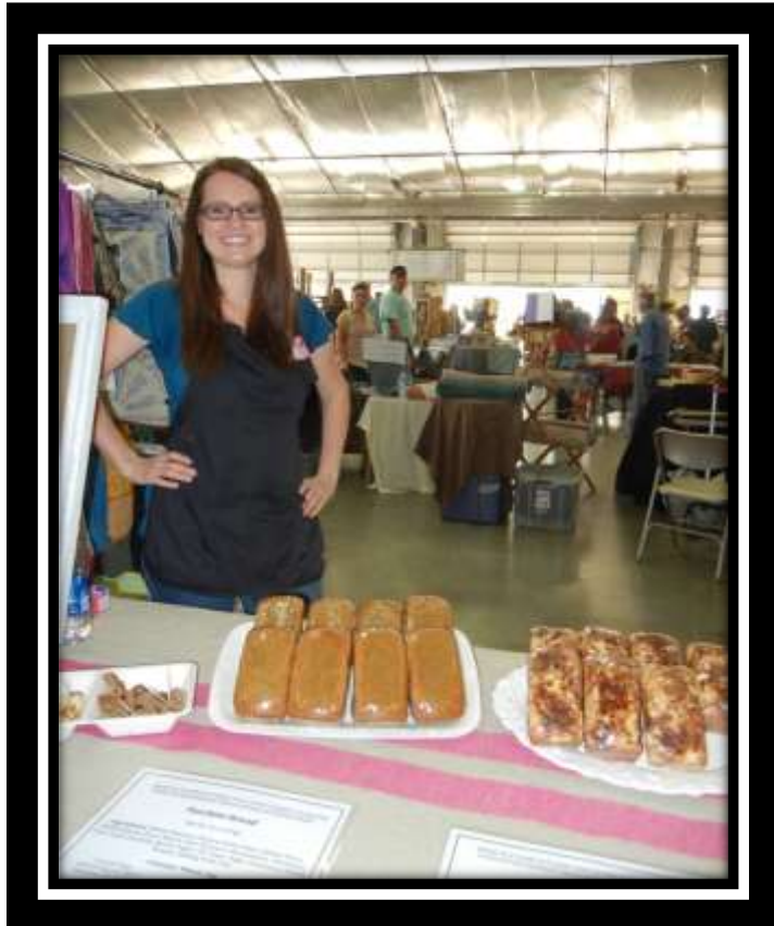
Homemade Baked Goods